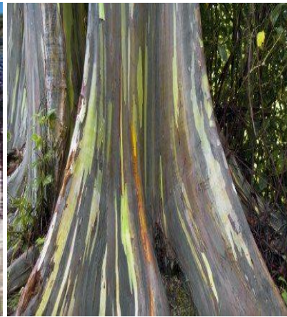
Fig 4: Rainbow ( E.G ) [13].