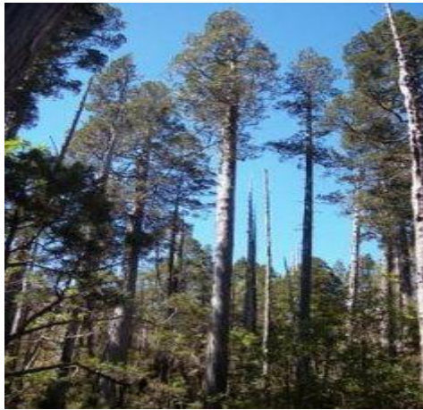
Fig 3: Whole tree of ( E.G ) [12].