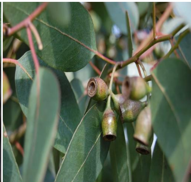
Fig 2: fruit of ( E.G ) [11] .