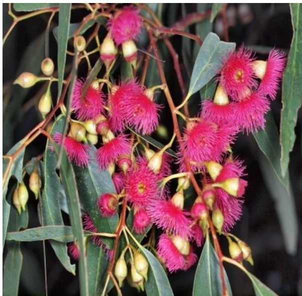
Fig 1: Flower of ( E.G ) [10] .